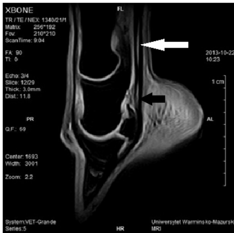
Fig. 1. A sagittal view of the six years old Holsteiner dressage gelding with the left forelimb lameness of 5 months duration. The horse was positive to the abaxial sesamoid nerve block. There is a core lesion in the DDFT at the level of the distal end of the proximal phalanx extending to the level of the middle phalanx (white arrow). Concurrent lesion is present caudally to the proximal recess of the navicular bursa, with irregular dorsal surface of the DDFT and increased signal intensity between the DDFT and the navicular bursa (black arrow).