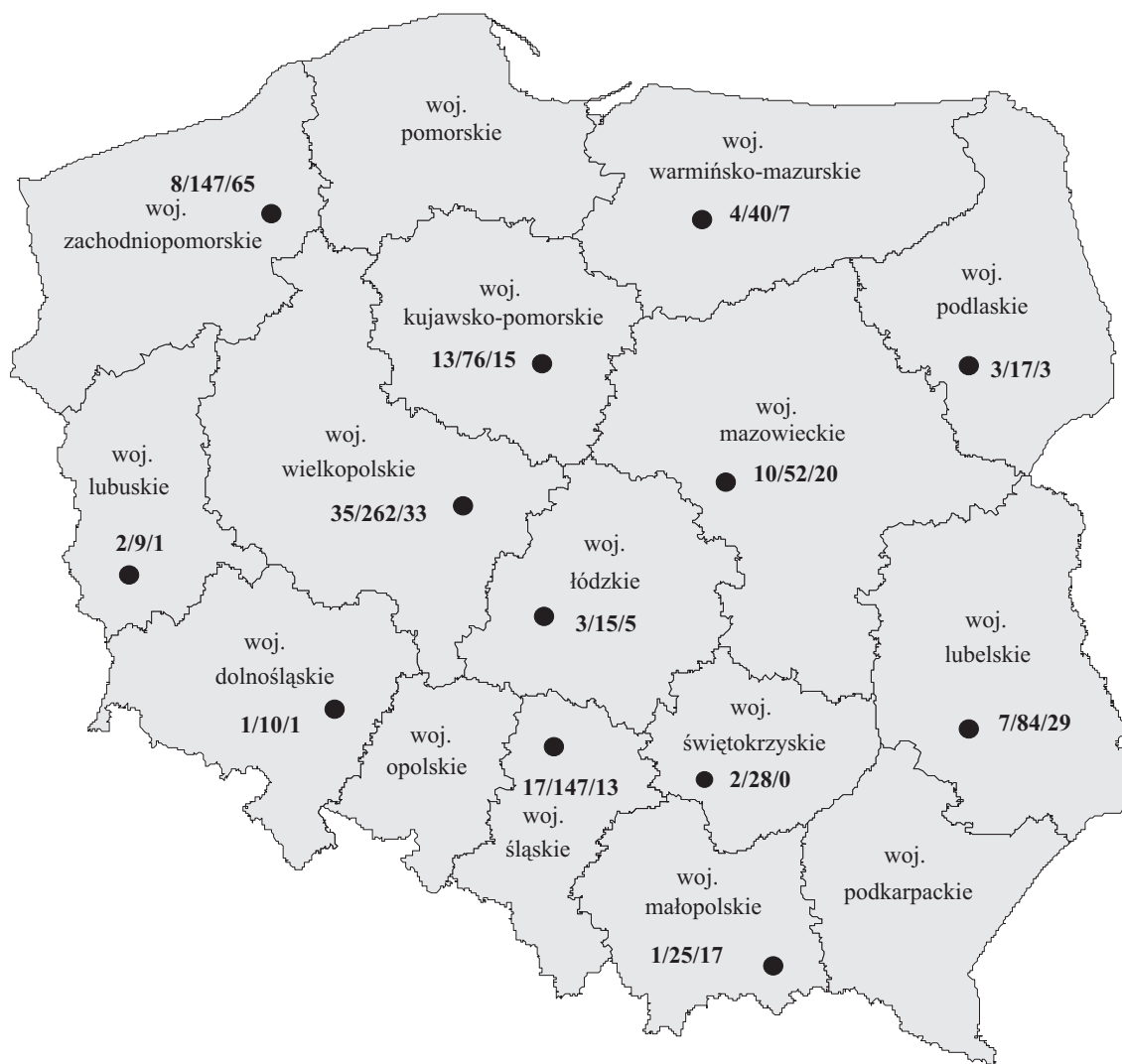
Fig. 1. Results of isolation of Bbr . Legend: red dot – provinces from which samples were tested, first number – number of farm tested from individual province, second – number of samples tested, third – number of Bbr isolates.